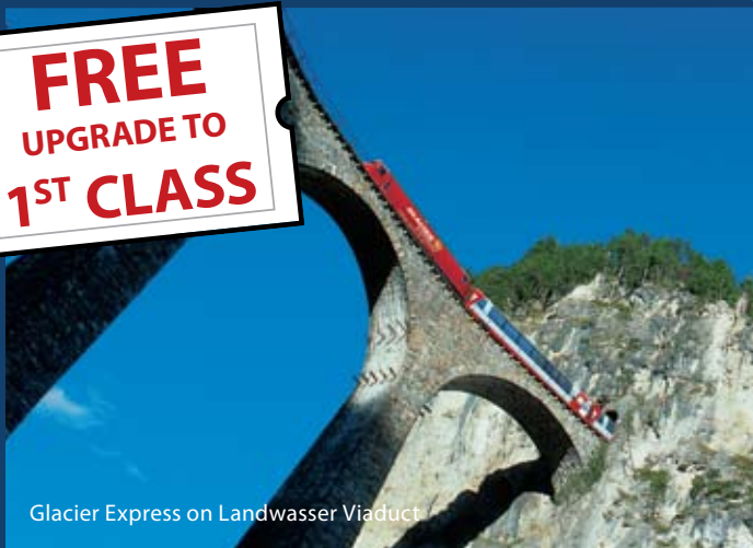
Glacier Express on Landwasser Viaduct

Swiss Passes allow travel on more than 20,000kms of train, bus and boat routes within Switzerland and the public transportation systems of 35 Swiss Cities. For a short time only, simply book a 2nd class pass and receive a free upgrade to 1st class