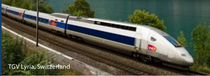
TGV Lyria, Switzerland

TGV Lyria trains whisk you between the heart of Paris and some of Switzerland's most beautiful cities. In late 2009, the lines between France and Switzerland were upgraded allowing trains to travel at greater speeds, offering more frequent services and now you can experience these spectacular journeys for so much less.